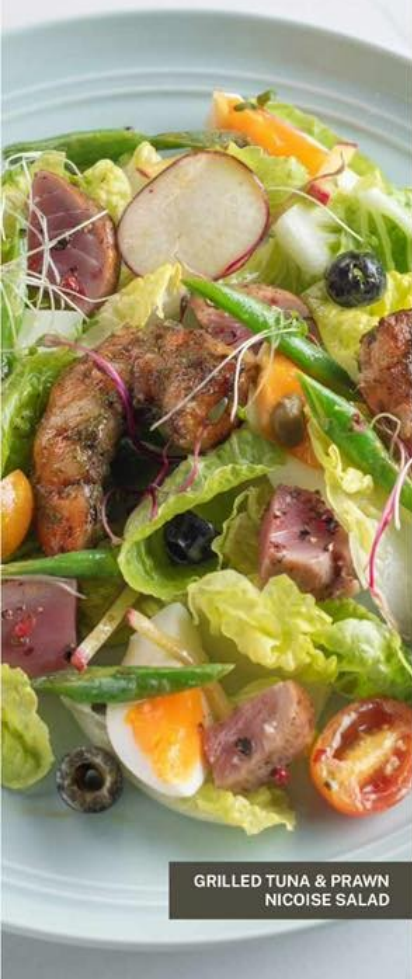
GRILLED TUNA & PRAWN NICOISE SALAD